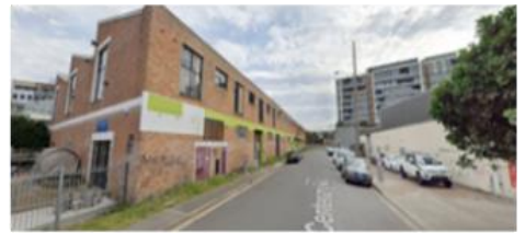
Centenary Road, Newcastle – 18%