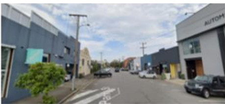
Parry Street, Newcastle West – 25%