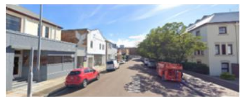
Wood Street, Newcastle West – 36%