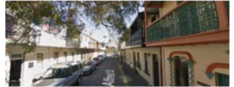
Alfred Street, Newcastle East – 91%