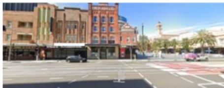
Hunter Street, Newcastle (Civic) – 95%