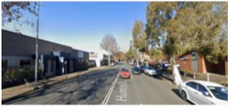
Hunter Street, Newcastle West – 21%