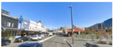
Hunter Street, Newcastle (Worth Place to Union Street) – 67%