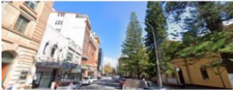
Hunter Street, Newcastle (East End) – 97%

The streetscapes with the highest support for having heritage value include Hunter Street (East End and Civic) and Alfred Street, Newcastle East.