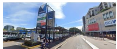
Steel Street, Newcastle West (Marketown) – 10%

There will be further opportunities to have your say. We will keep you updated as the project progresses.