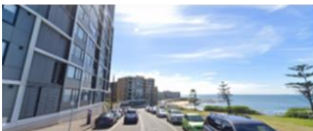
Shortland Esplanade, Newcastle – 47%