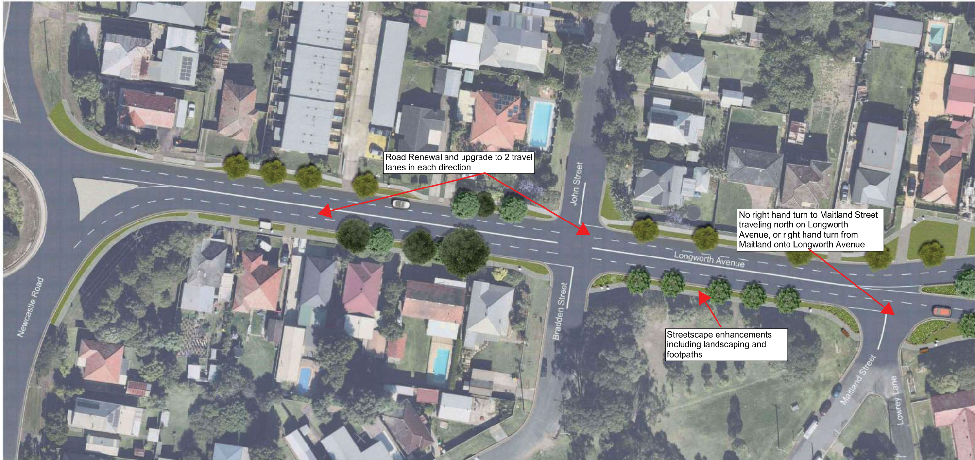
Longworth Avenue Upgrade Plan - South