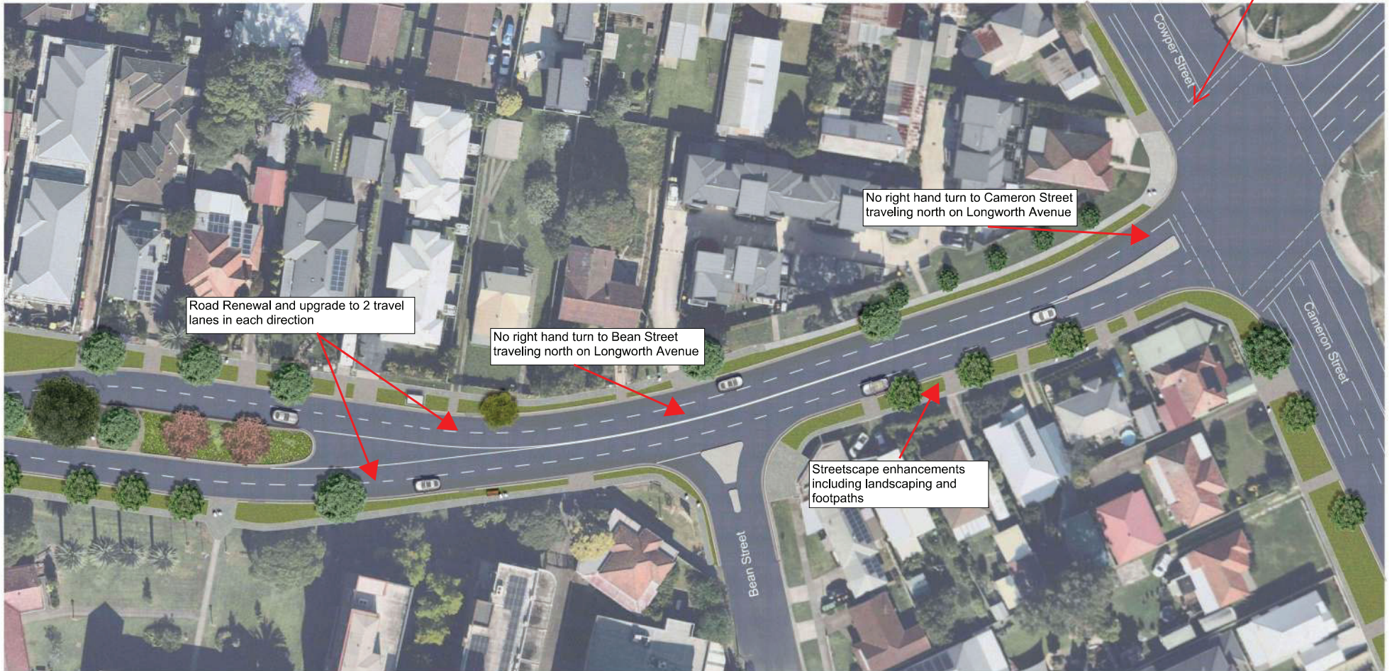
Longworth Avenue Upgrade Plan - North

Remove the existing "No Right Turn (Buses Excepted)" restriction at the intersection of Cowper Street and Longworth Avenue to allow all vehicles to turn right from Cowper Street to Longworth Avenue.