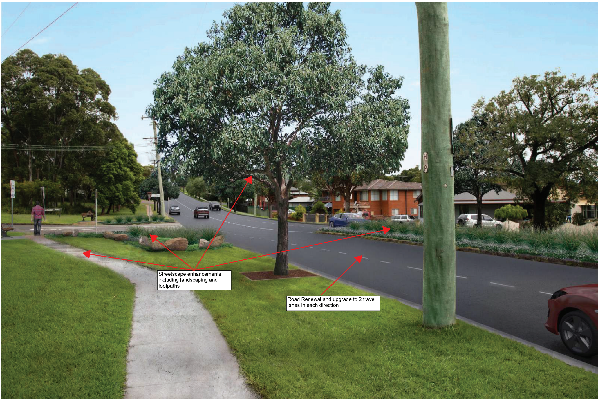
View South Along Longworth Avenue