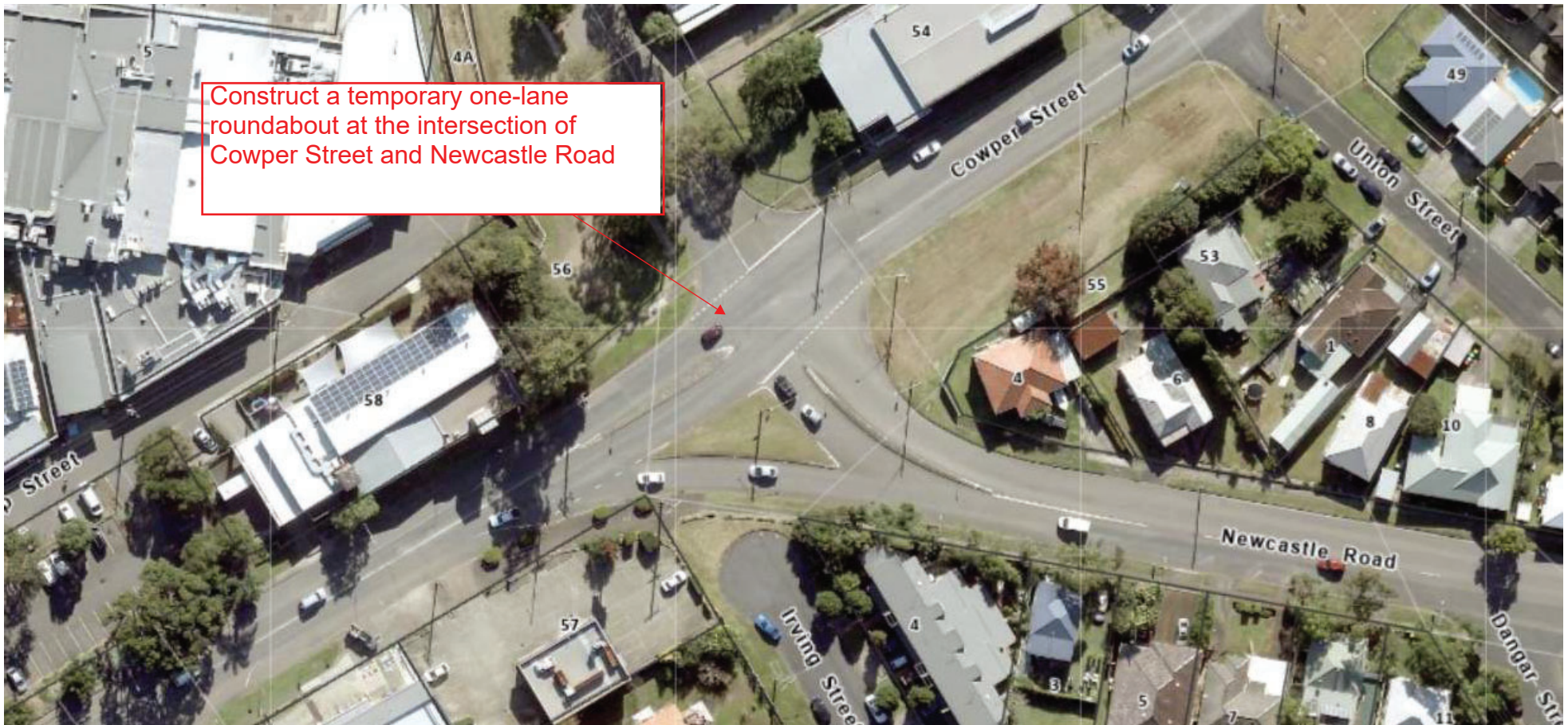
Newcastle Road Cowper Street temporary roundabout included in Longworth Avenue adopted concept.