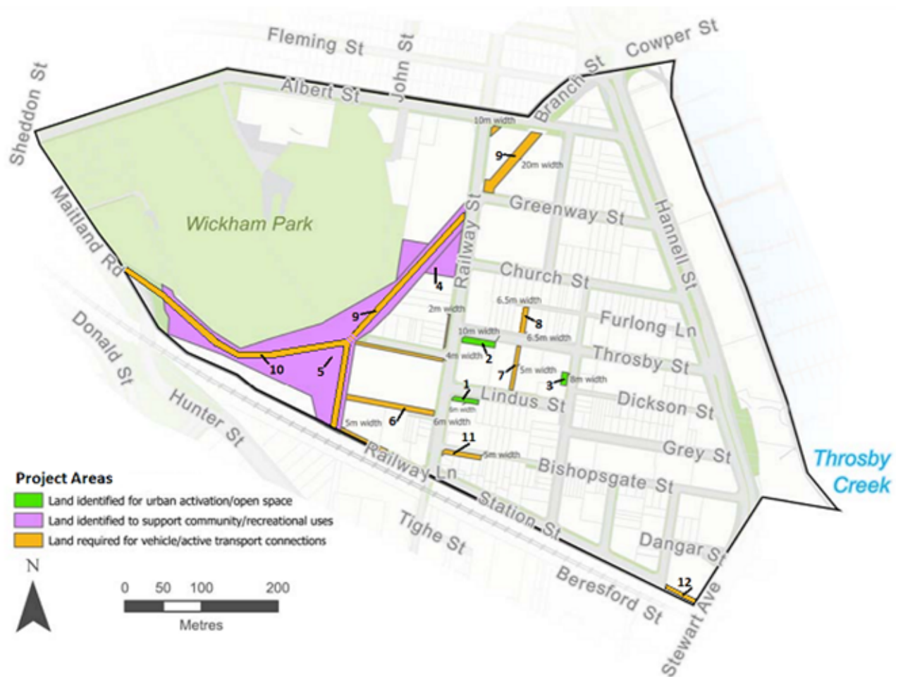
Figure 3: Map of community infrastructure projects in Wickham