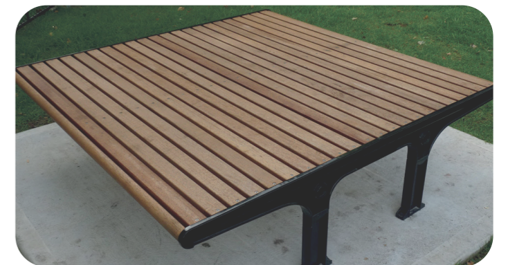
Proposed seat table

Refer to SK2 for Maryland Dog Park Concept.