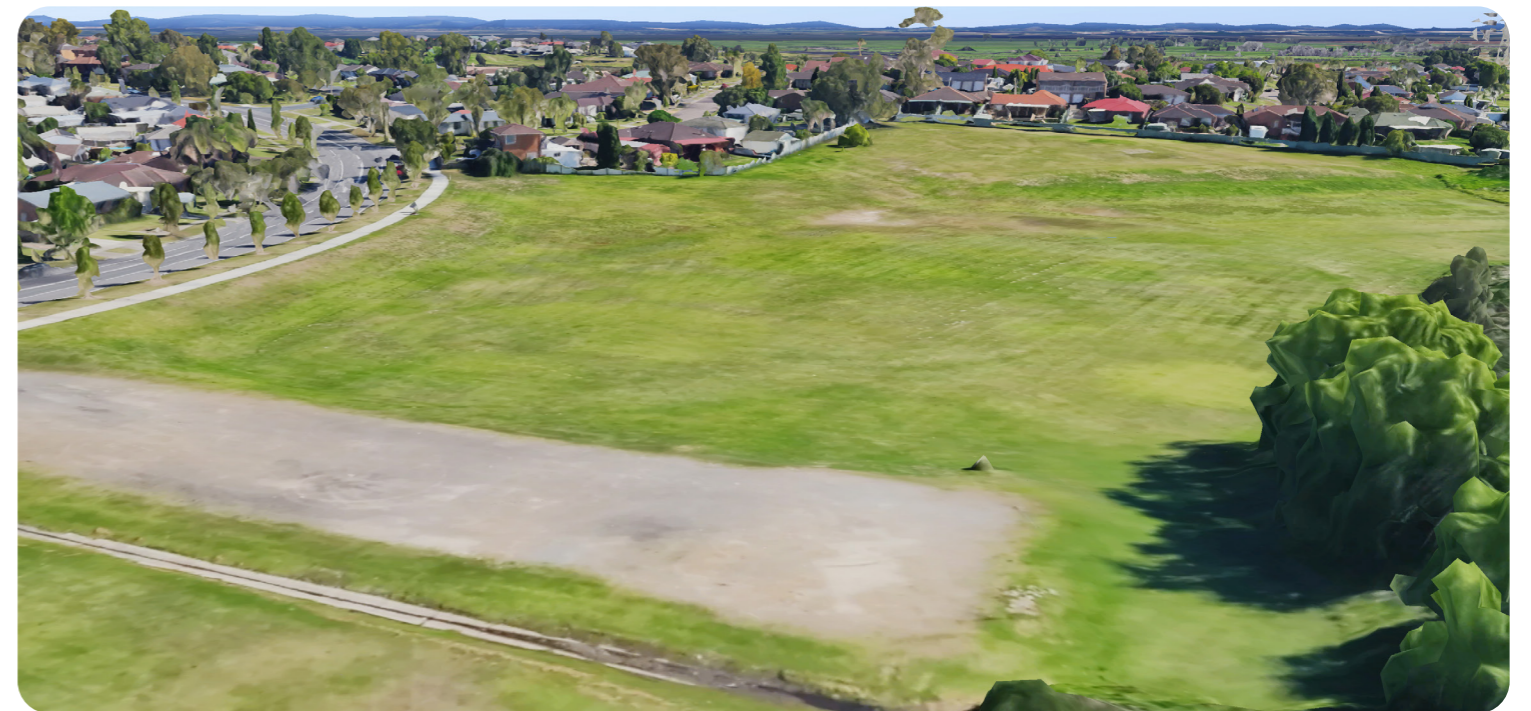
Existing Maryland dog off-leash area.