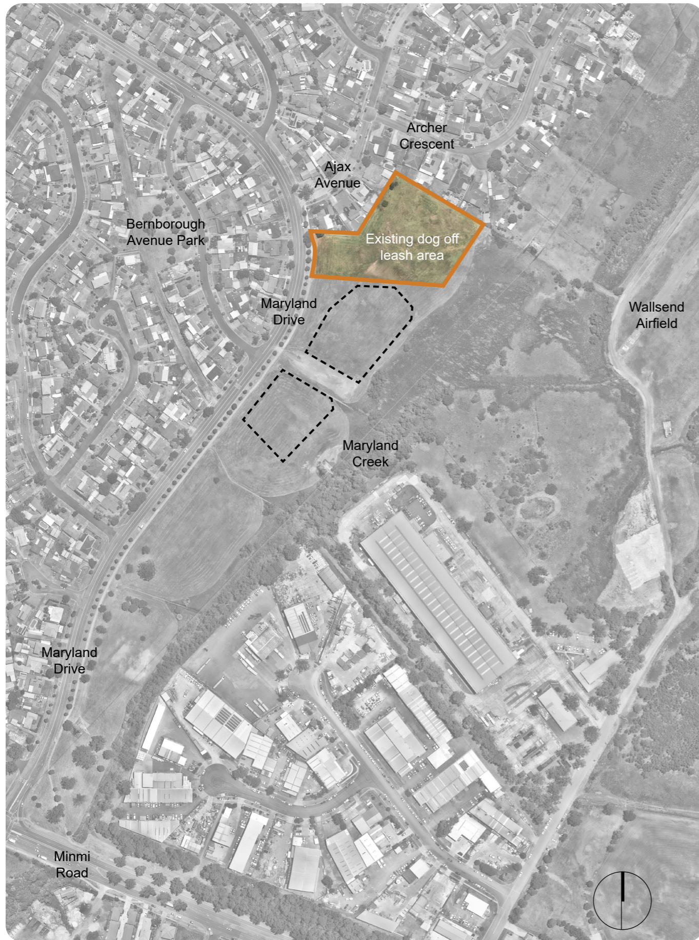
Site Plan N.T.S.